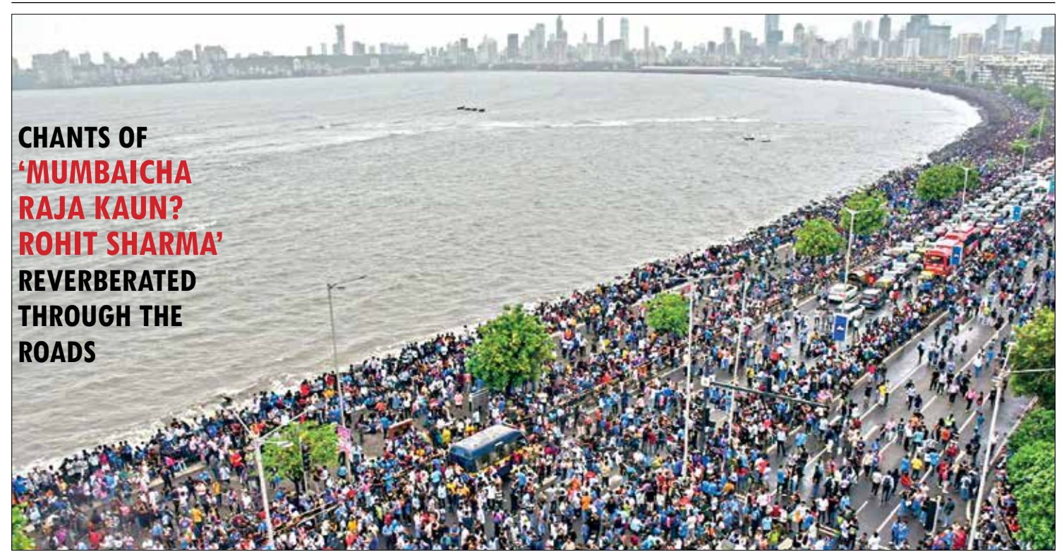
Fans gather outside the Wankhede Stadium for victory parade in Mumbai on Thursday

MUMBAI/NEW DELHI: Their day started with breakfast at Prime Minister's residence and ended among a sea of fans who brought the 'Maximum City' to a standstill as India's T20 World Cup-winning cricketers beat the exhaustion of a 16-hour flight to enjoy a euphoric homecoming that resembled a giant street